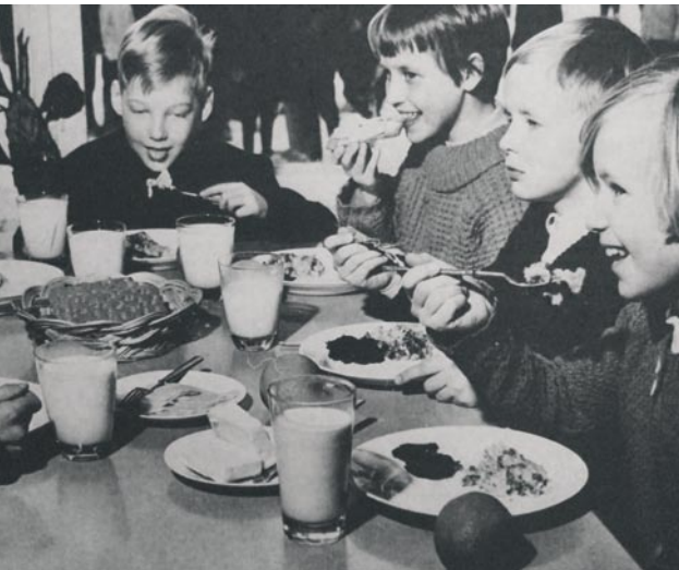
Free school meals have long traditions in Finland.

Pre-primary and basic education are provided free of charge for all, and this includes school meals, teaching materials, school transport, and pupil welfare services.